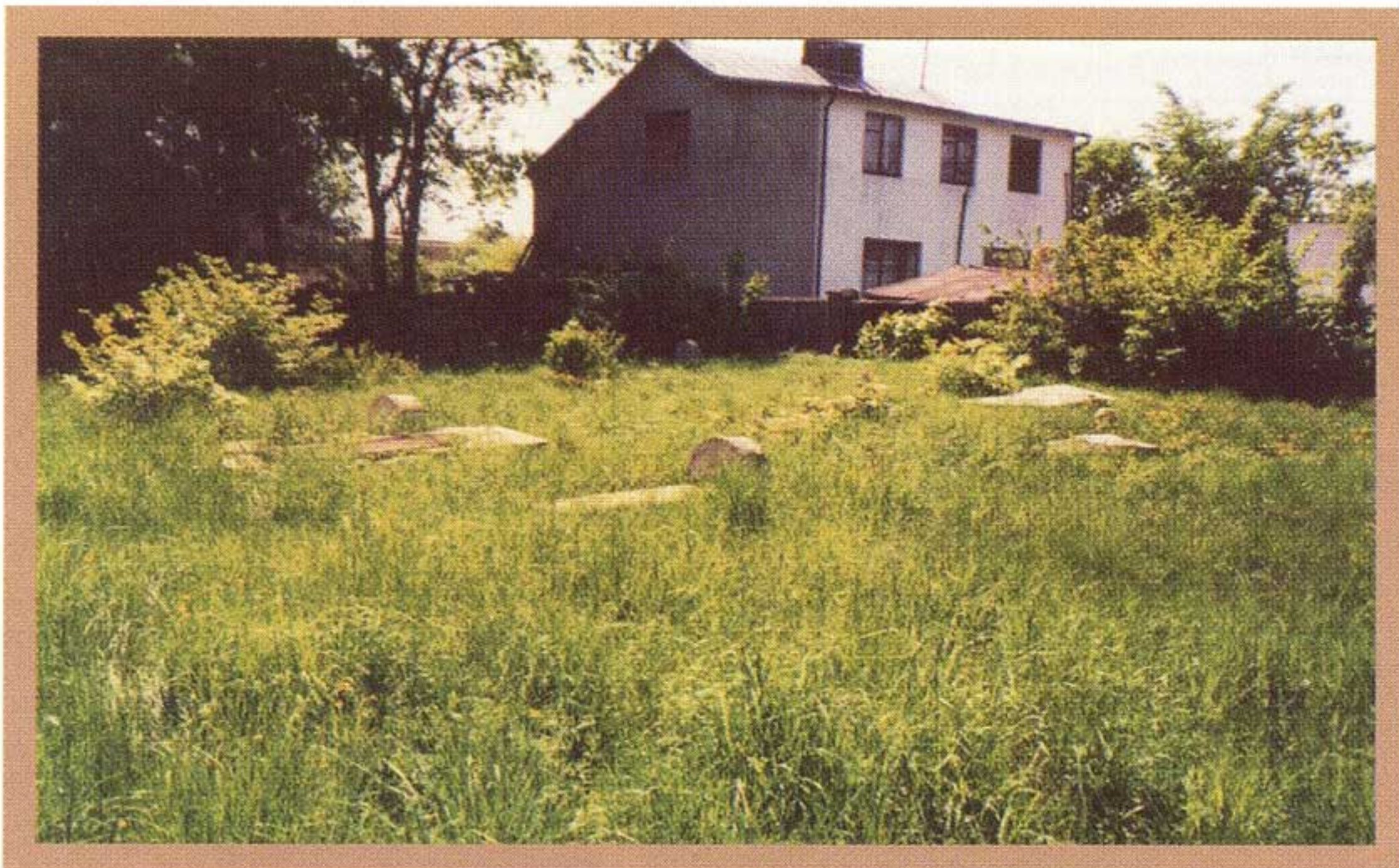
ul. Brzeska 60, Jewish cemetery, 1997