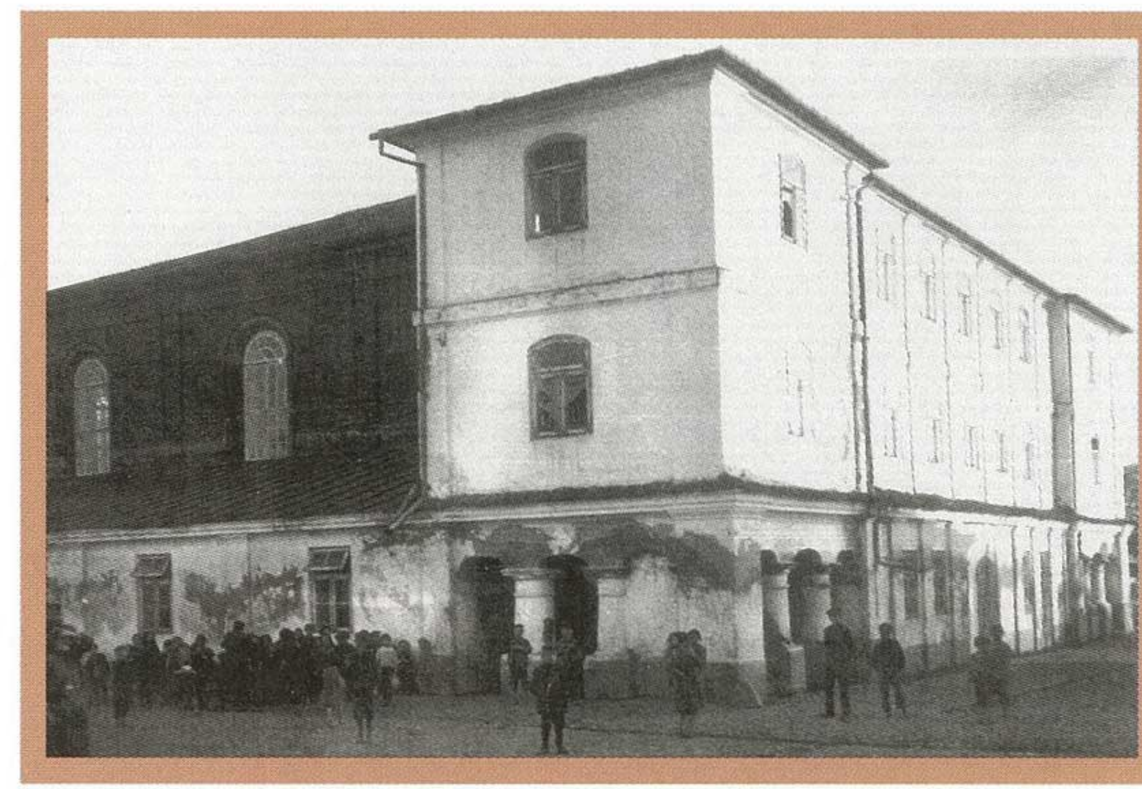
Synagogue, c. 1919

ul. Nassuta, Poprzeczna and Nadbrzezna Synagogue destroyed during the Holocaust. Current site use: apartment complex.