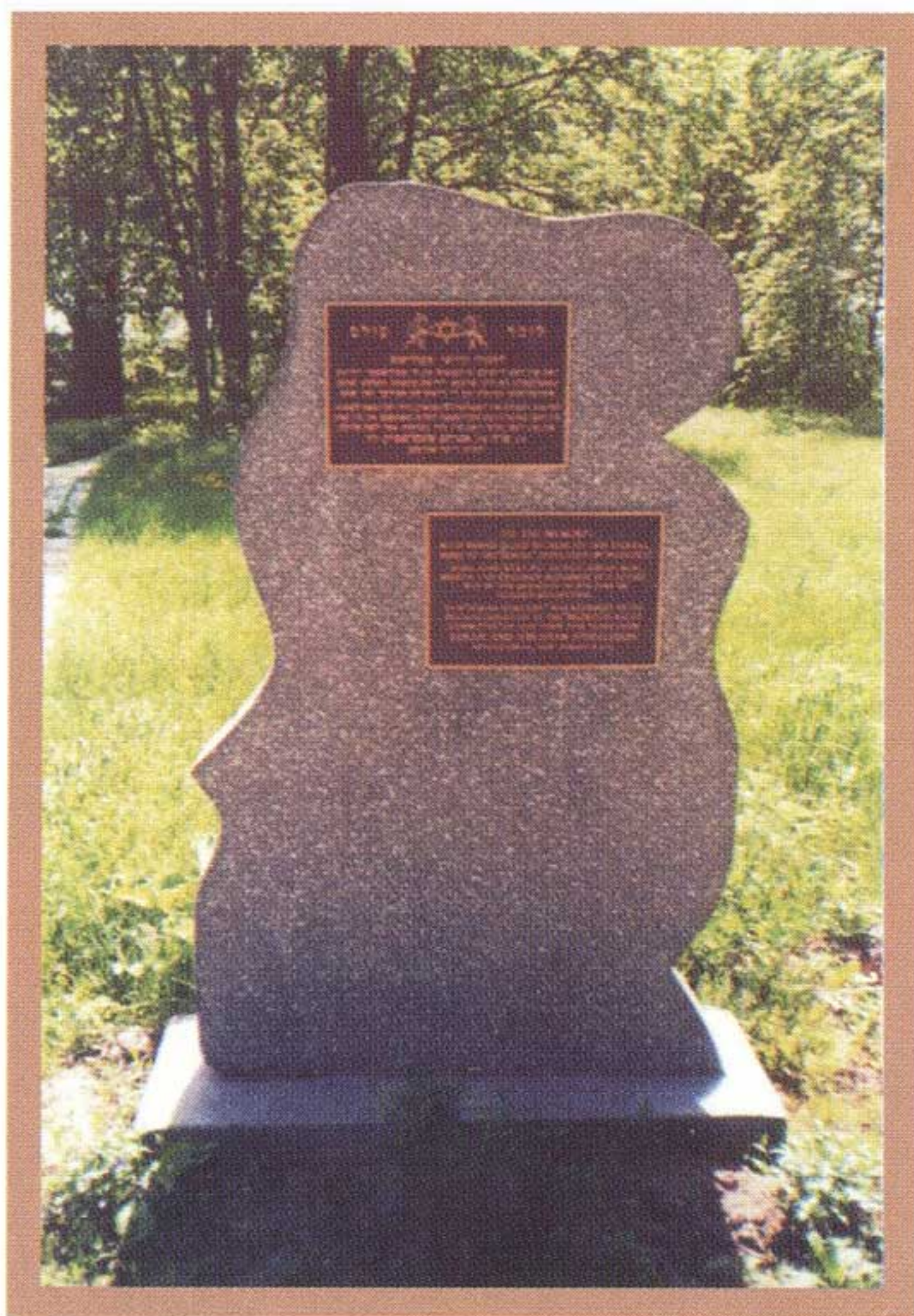
ul. Brzeska 60, Jewish cemetery, 1997; Holocaust monument

Monument to Jewish victims from Międzyrzec and surrounding towns.