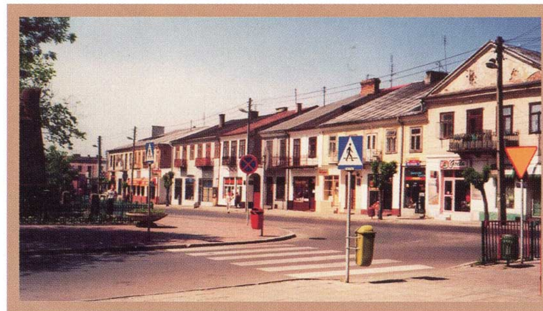
Former Jewish region, now part of town square, 1997