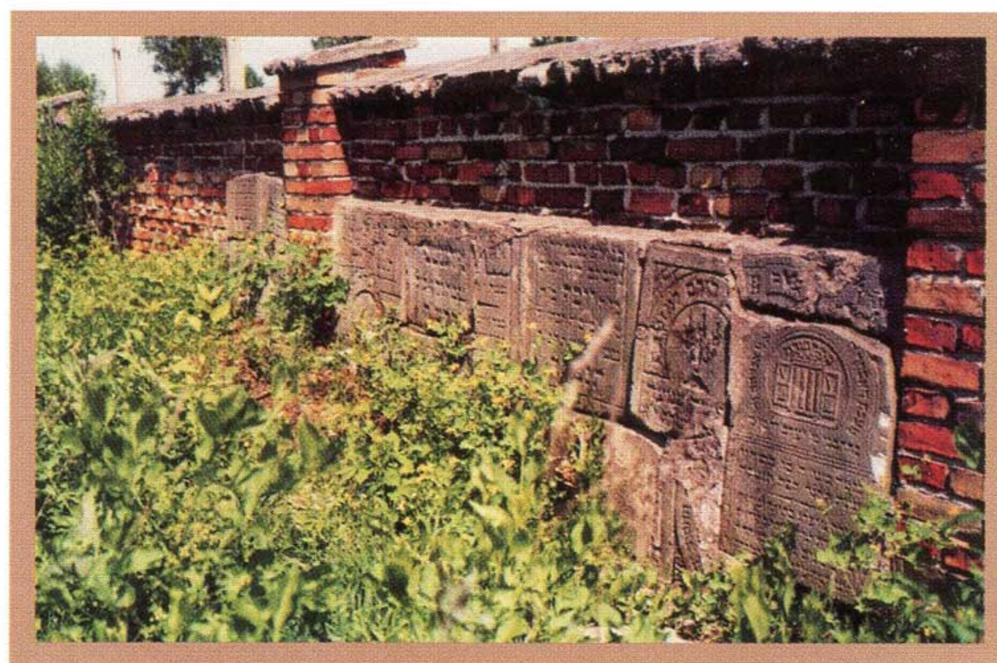
ul. Brzeska 60, Jewish cemetery, 1997; portion of wall made from tombstone fragments