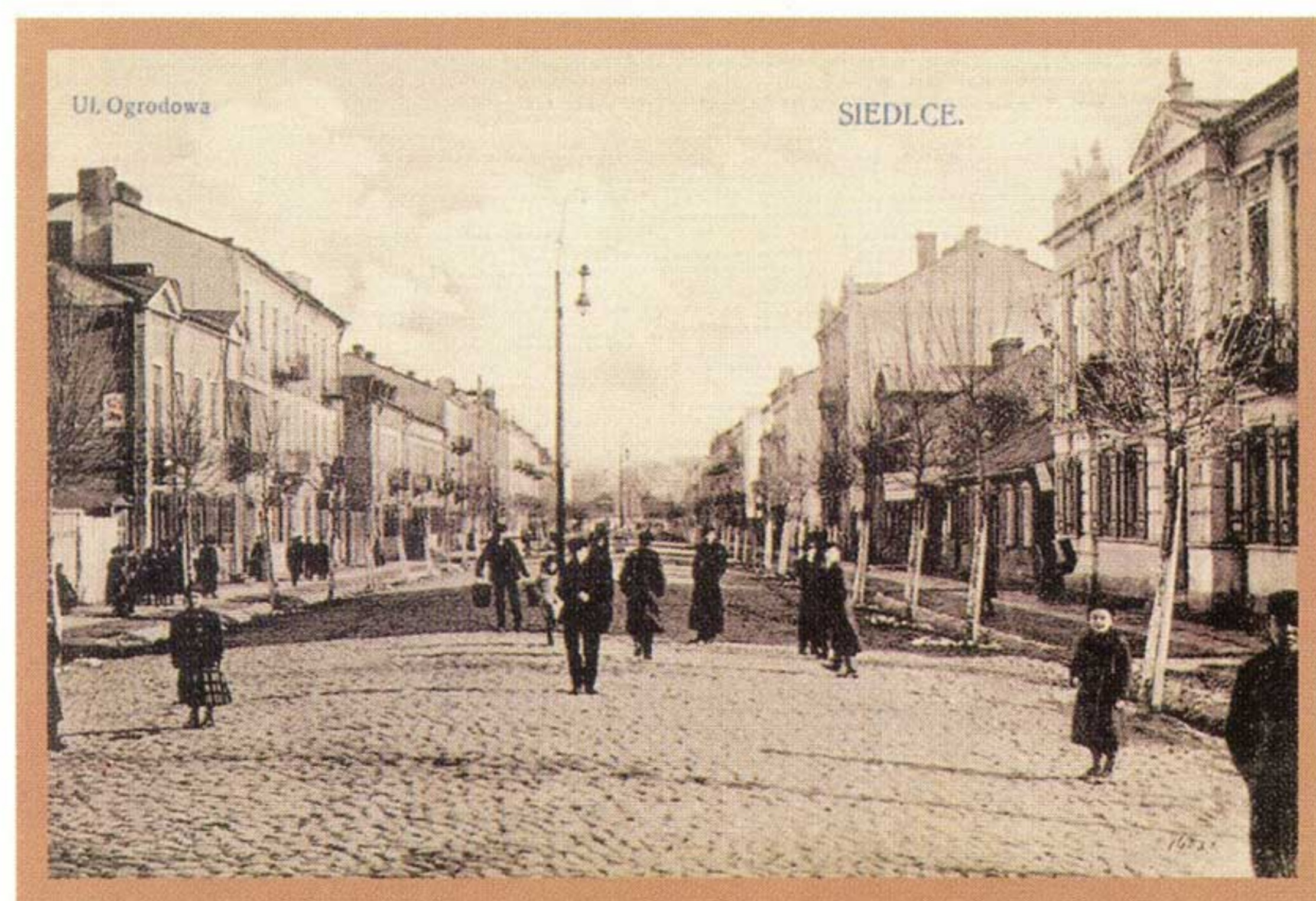
■ ul. Ogrodowa, c. 1917 4

Holocaust monument formed from 100 tombstones.