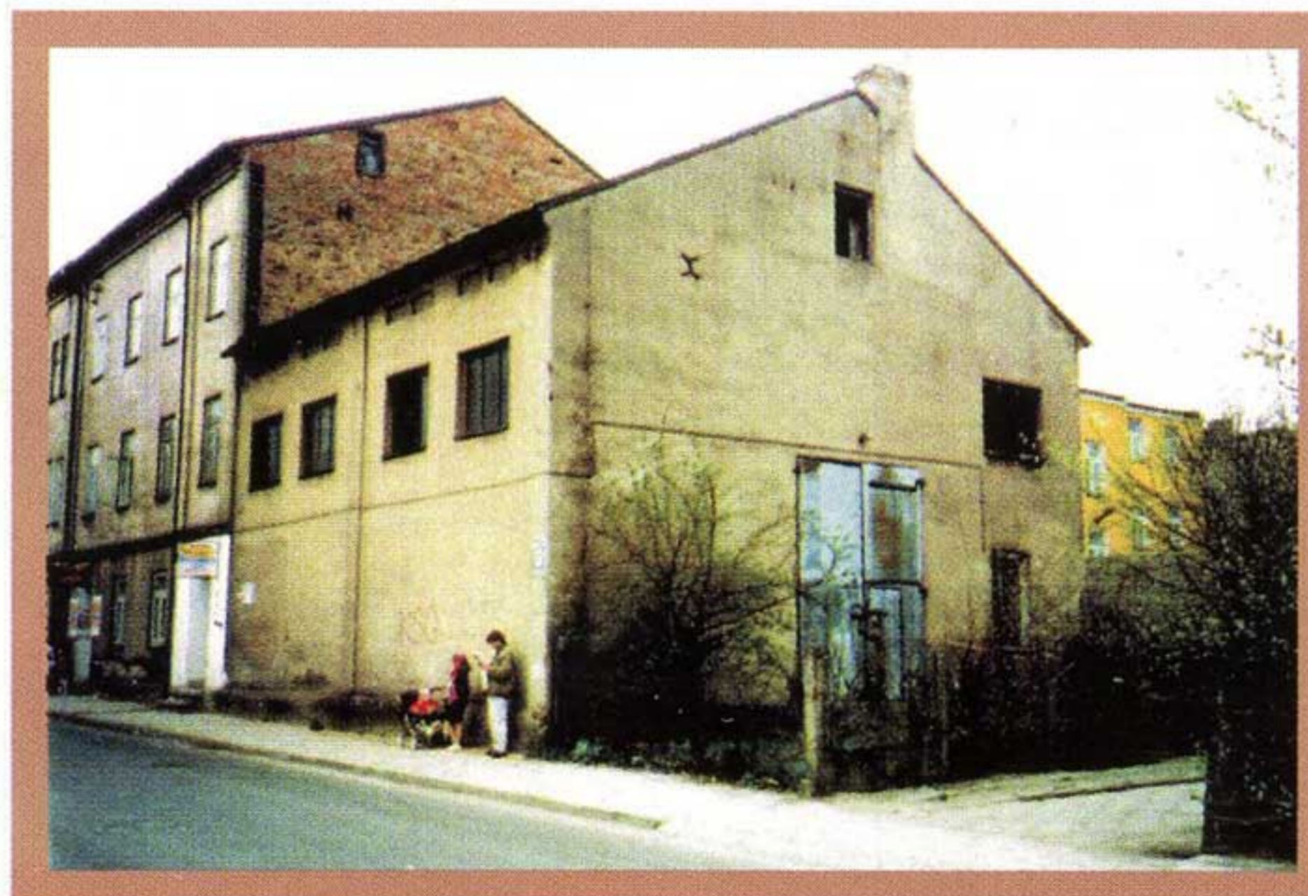
Bet Midrash, ul. Czerwonego Krzyża 13, 1994