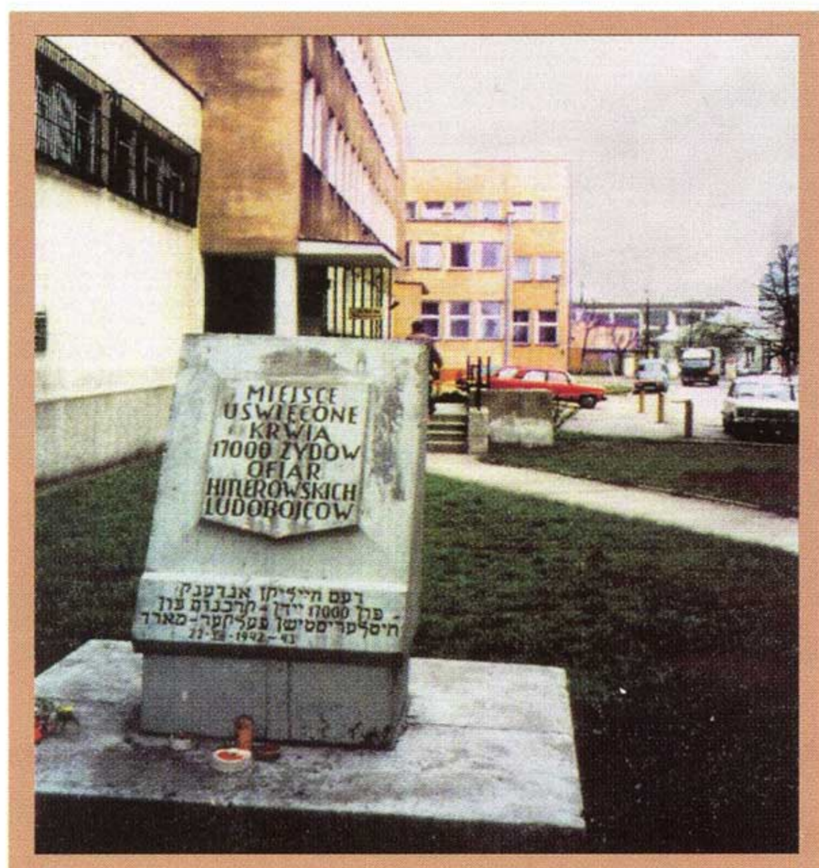
■ Holocaust monument, ul. Bohaterów Getta, 1994 3

About 1,000 tombstones remain, dating from the nineteenth century.