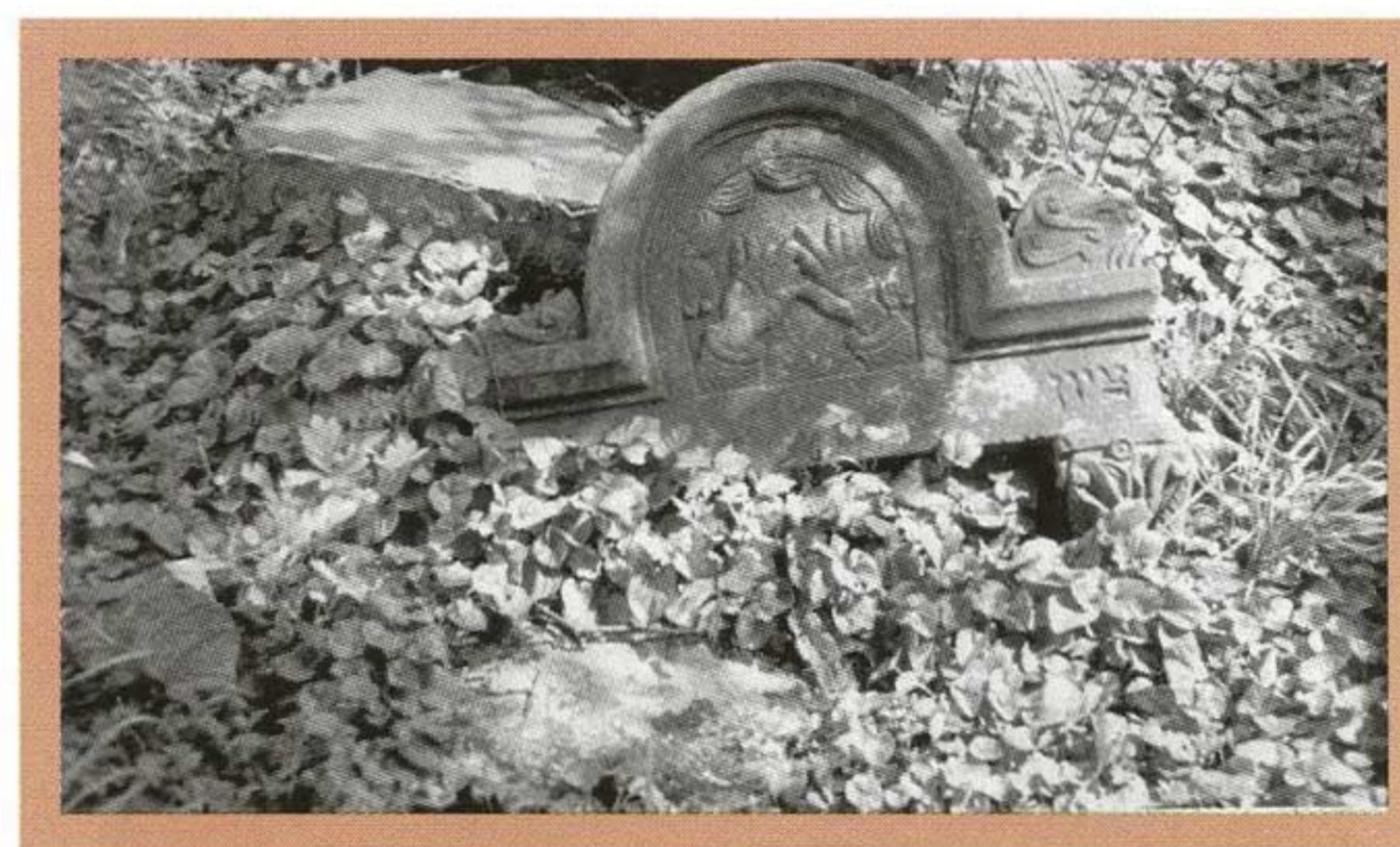
■ Jewish cemetery, ul. Szkolna, 1994 5

Kaspi, Isaac. Megilat pera'ot Shedlets bi-shenat 1906 (Chronicle of the Siedlce Pogrom in 1906). Tel Aviv: I. Kaspi, 1947. (H).