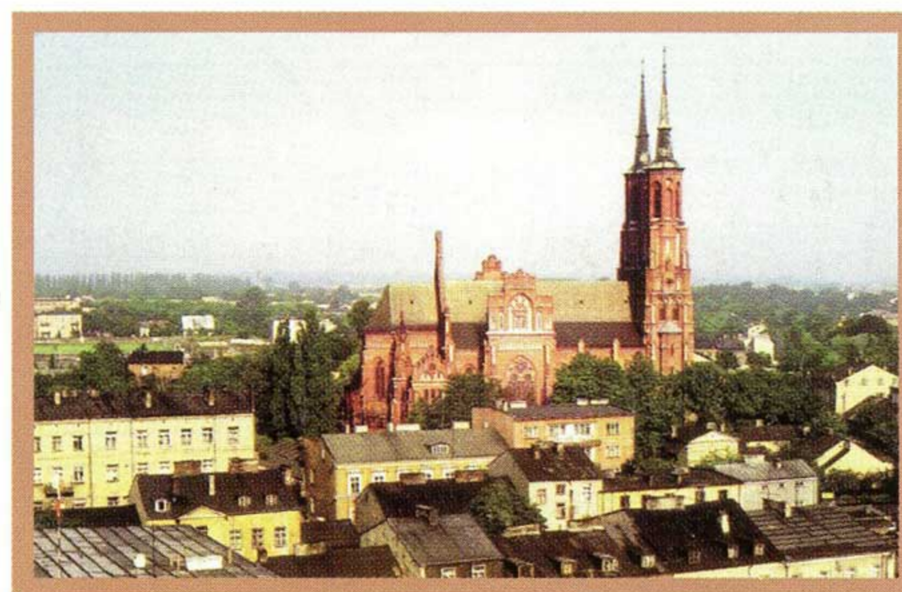
■ Siedlce, today 6